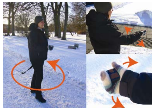
Figure 6. a) Whole body rotation keeping the arm and hand fixed relative to the body, b) arm scan, c) wrist flex

We saw three main types of standing still gestures. The first, which basically all users made use of, was to hold the device out in front of the body, keeping the arm and hand position fixed relative to the body, and walk around on the spot (sometimes in a small circle), see figure 6a. A gesture which was used both while walking and while standing still was the arm scan. In this gesture the arm was moved to the side and back again, see figure 6b. This gesture occurred to one side only or from side to side. The third type was hand movement only – the user moved the hand by flexing the wrist (figure 6c). This gesture was also used both standing still and while walking.