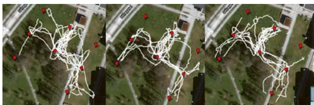
Figure 3. Trails for 10 ° (left), 30 ° (center) and 60 ° (right)

Trails at the main (more realistic) test location can be seen in the following sequence of images.