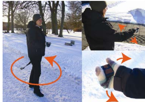
Figure 6. a) Whole body rotation keeping the arm and hand fixed relative to the body, b) arm scan, c) wrist flex

We saw three main types of standing still gestures. The first, which basically all users made use of, was to hold the device out in front of the body, keeping the arm and hand position fixed relative to the body, and walk around on the spot (sometimes in a small circle), see figure 6a. A gesture which was used both while walking and while standing still was the arm scan. In this gesture the arm was moved to the side and back again, see figure 6b. This gesture occurred to one side only or from side to side. The third type was hand movement only – the user moved the hand by flexing the wrist (figure 6c). This gesture was also used both standing still and while walking.