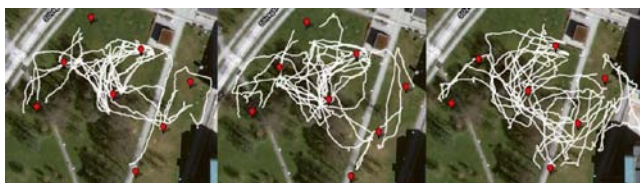
Figure 4. Trails for 90 ° (left), 120 ° (center) and 150 ° (right)