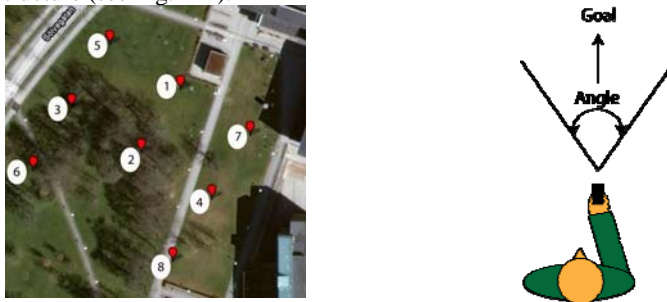
Fig. 1. A) The grid points for the test trails. B) The angle interval.

To see what happens in a completely open environment we also carried out three tests in an open field further away. The test tracks at both locations were based on a grid structure (see Fig. 1 A).