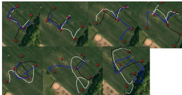
Fig. 2. Trails for 10°, 30°, 60°, 90° (top row), 120°, 150° and 180° (bottom row).

Looking at the three tests done on an open field we can see the trend quite clearly. In the top row of Fig. 2 we see the angles 10°, 30°, 60° and 90°. All these trails follow the intended path quite well, although we begin to see some deviations in the rightmost picture. In the bottom row of Fig. 2 we see the wider angles resulting in more deviations and finally also loops.